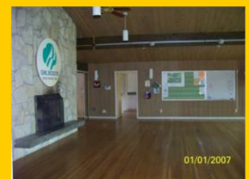
Lodge Upstairs Area