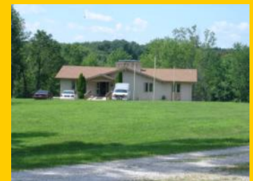
Front of Lodge