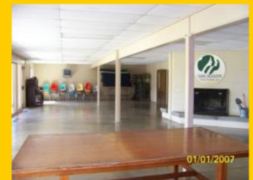
Lodge Downstairs Area