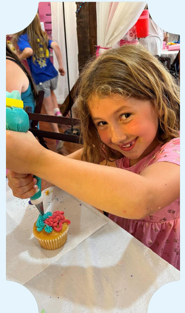
2023 Double Stellar Seller Event