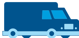
Cargo Van (seats in) 200 cases

Estimate how many cases of cookies will fit in your empty vehicle using all space except the driver's seat. Avoid carrying cookie cases and children in the passenger area of a vehicle simultaneously.