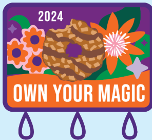
25+ Packages Charm Patch

As girls reach each instant reward level, the TCPC will give them the reward items, no waiting necessary!