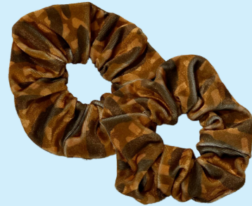
125+ Packages Samoas Scrunchie Set