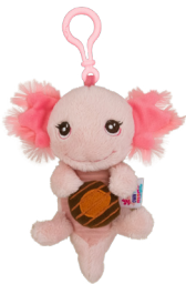
180+ Packages Mini Plush Axolotl

TCPCs receive the following items at cookie delivery in February and distribute them to Girl Scouts along with the cookies.