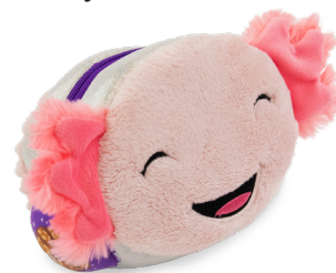
175+ Packages sold through Digital Cookie Axolotl Zipper Pouch