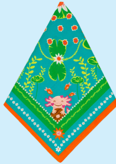
75+ Packages Axolotl Bandana