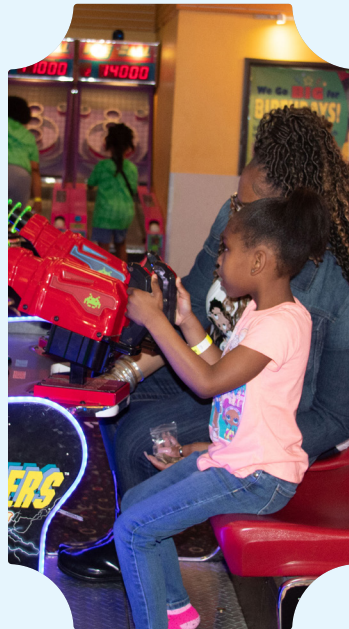
2023 Stellar Seller Event