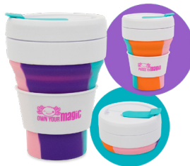
225+ Packages Collapsible Silicone Travel Cup