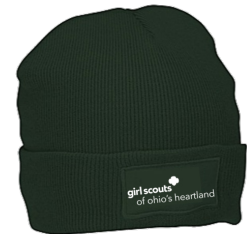
170+ Packages Troop PGA Matching GSOH Beanies for each participating Girl Scout