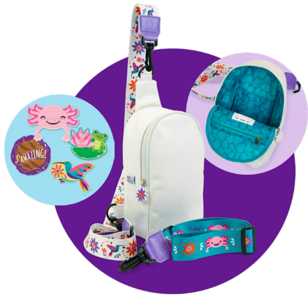
400+ Packages Crossbody bag & fashion patches OR $10 Reward Card OR The Shoe That Grows – 1 shoe