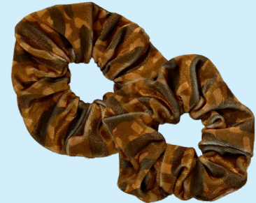
125+ Packages Samoas Scrunchie Set