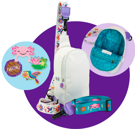
400+ Packages Crossbody bag & fashion patches OR $10 Reward Card OR The Shoe That Grows – 1 shoe