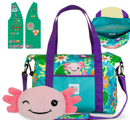
500+ Packages Weekender tote & axolotl pillow OR Girl Scout Uniform OR The Shoe That Grows – 1 pair