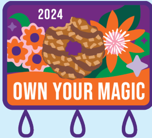
25+ Packages Charm Patch

Your Girl Scout will receive these rewards from her TCPC as soon as she reaches these levels!