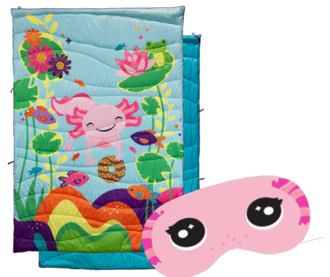
650+ Packages Puffy camp blanket & axolotl eye mask OR $20 Reward Card OR The Shoe That Grows – 1 pair