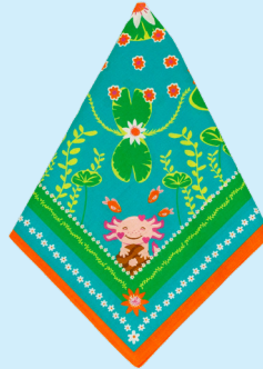
75+ Packages Axolotl Bandana